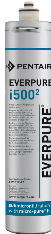
i500 Replacement Cartridge: OE9930

Everpure water treatment systems (excluding replaceable elements) are covered by a limited warranty against defects in material and workmanship for a period of five years after date of purchase. Everpure replaceable elements (filter cartridges and water treatment cartridges) are covered by a limited warranty against defects in material and workmanship for a period of one year after date of purchase. See printed warranty for details. Everpure will provide a copy of the warranty upon request.